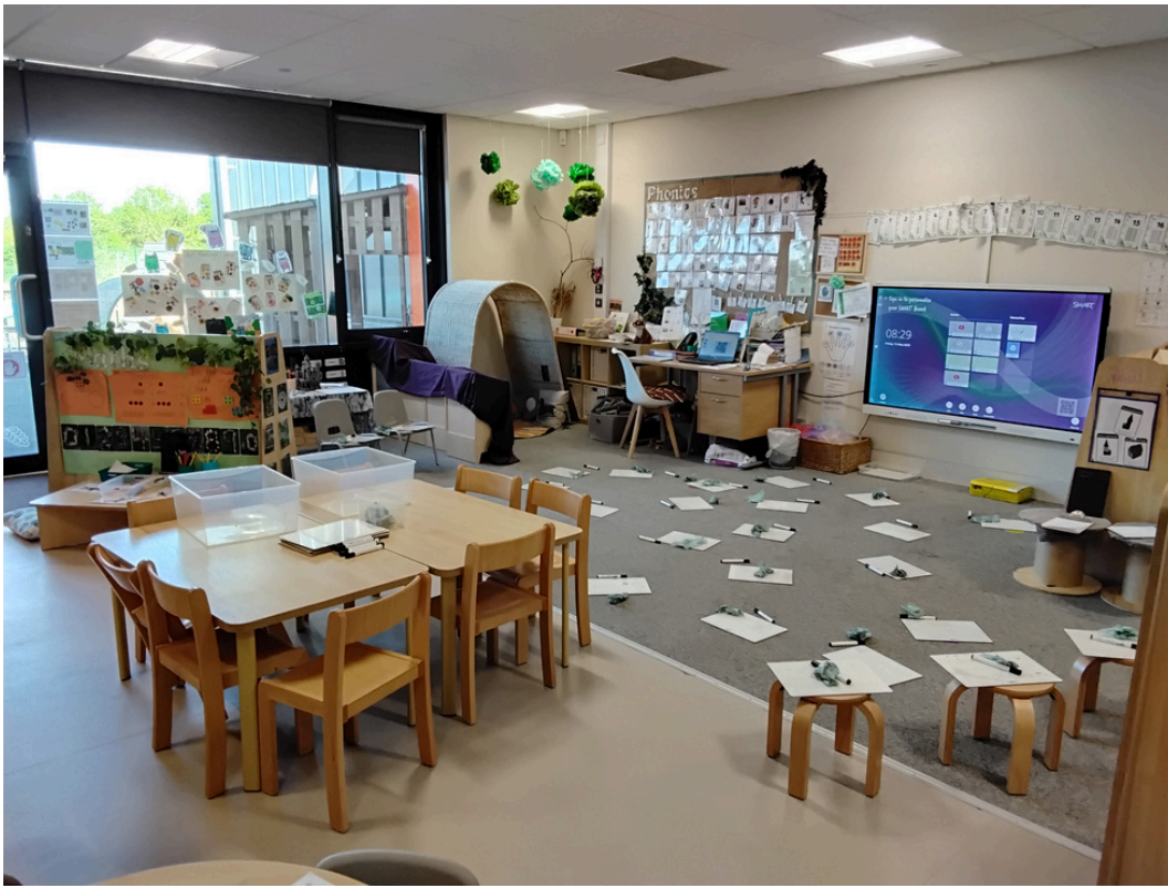
Our carpet area and adult-led activity table.