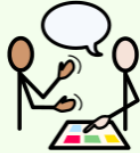
Communication and Language