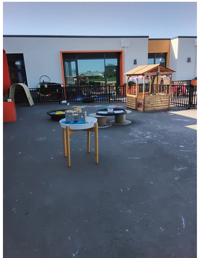
Our small world and construction hut.