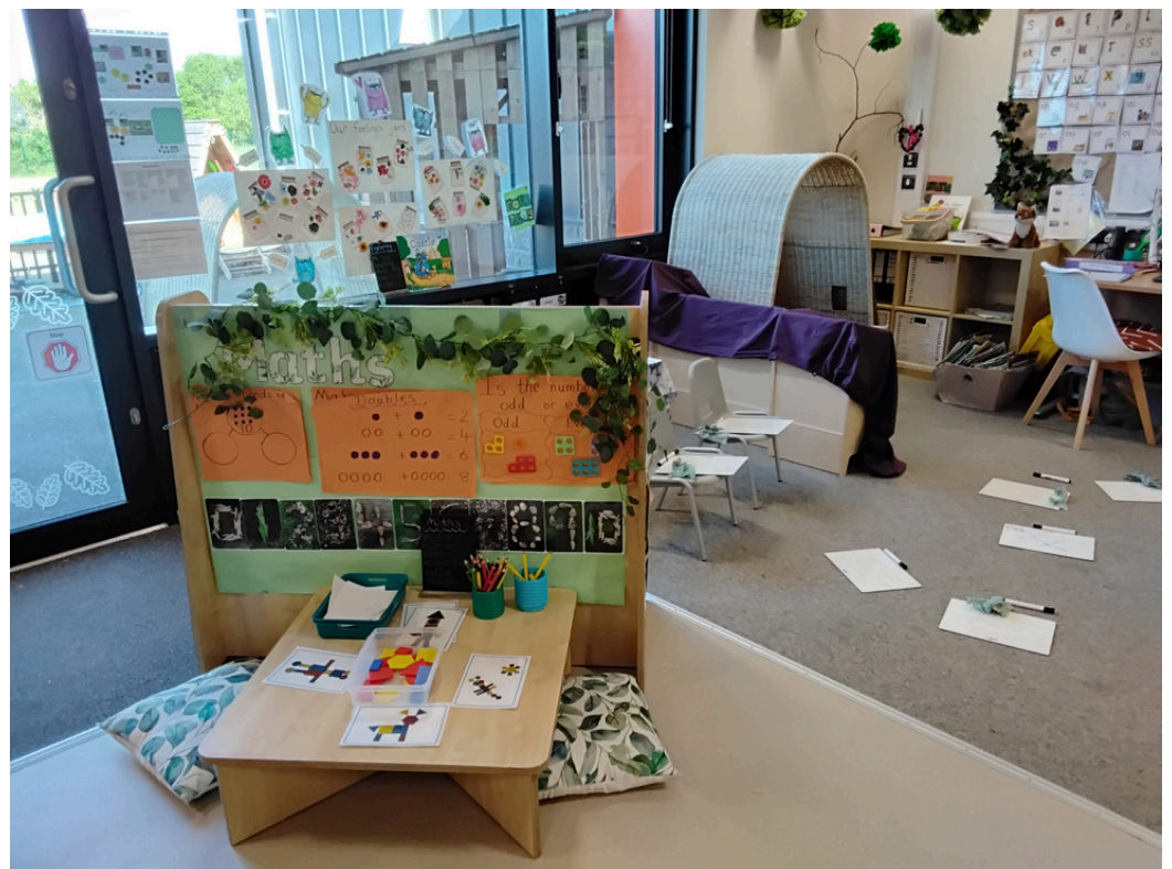
Our maths and reading area.