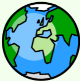
Understanding the World