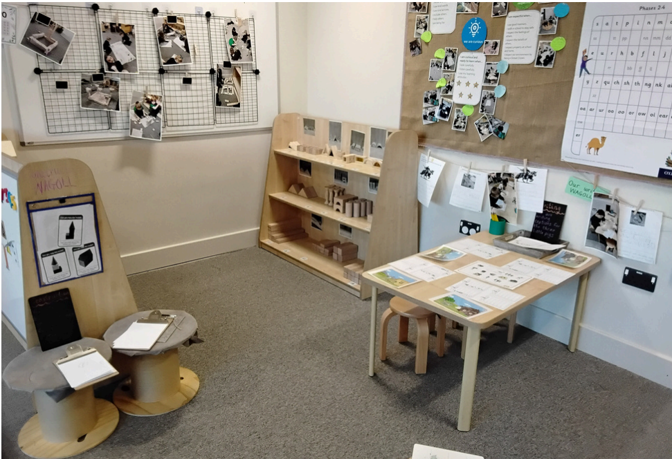
Our construction and writing area.