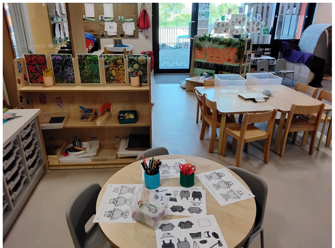
Our creative area.