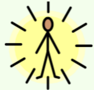
Personal, Social and Emotional Development