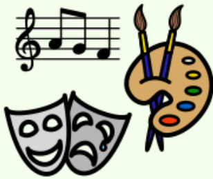
Expressive Arts and Design