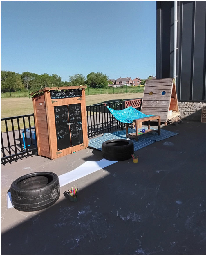
Our reading den and literacy area.